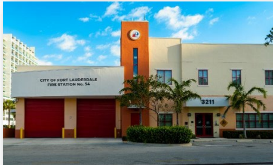
Fire Station #54