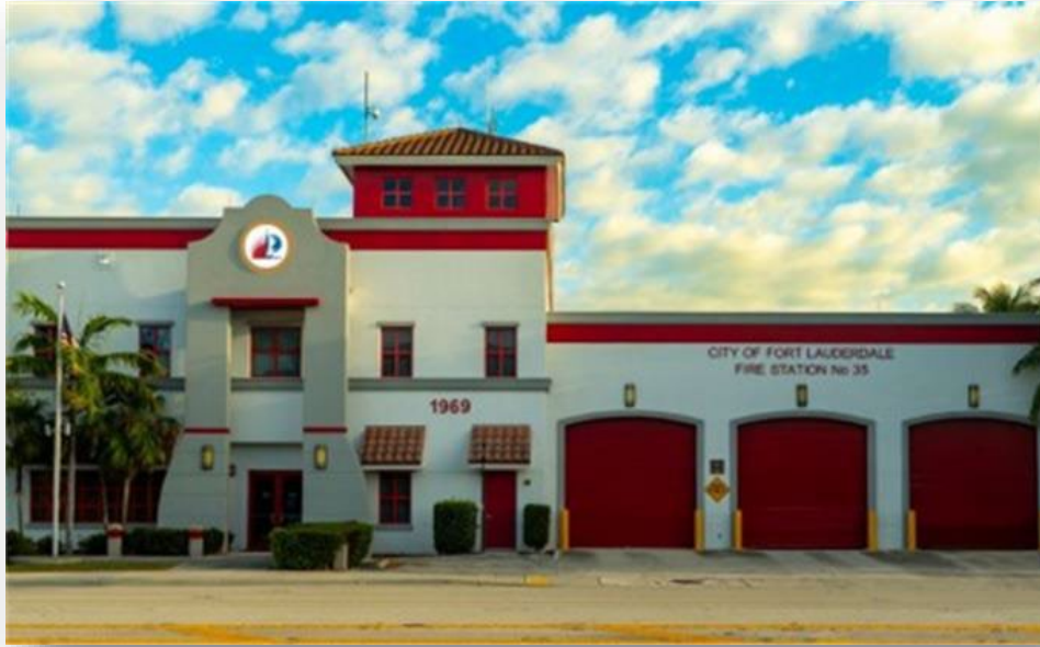
Fire Station #35