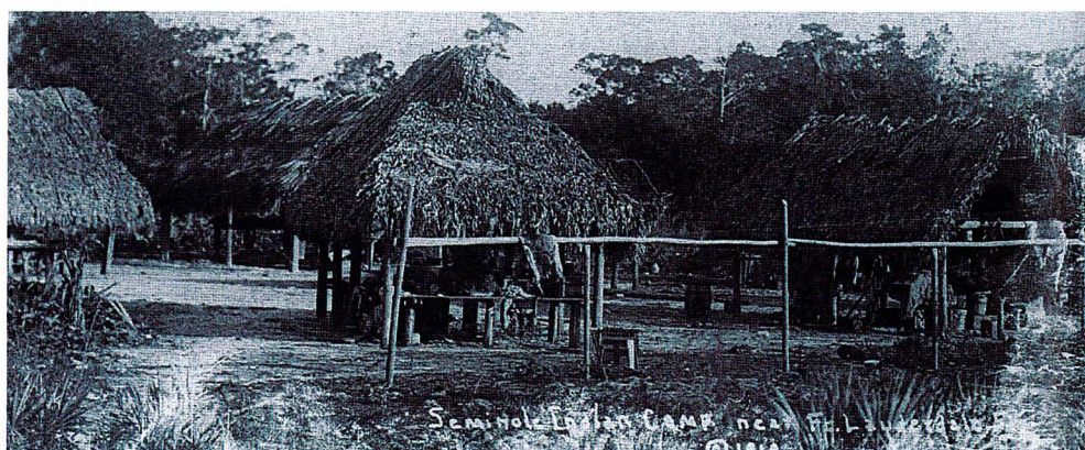
Photo of the Annie Tommie Seminole Camp, Source: Legendary Locals of Fort Lauderdale

In summary, the property is likely to contain elements of the Annie Tommie Camp and possibly portions of the Seminole Burial Ground. While there have been historical reports of a burial discovered in adjacent properties, there has not been a systematic archaeological investigation to locate a specific site. Redevelopment of the property is likely to have an adverse effect on these resources, and prior to any ground disturbances an intensive archaeological survey (Phase 1b-Phase II) should be completed. The results of the archaeological survey should determine whether additional archaeological work is recommended or required.