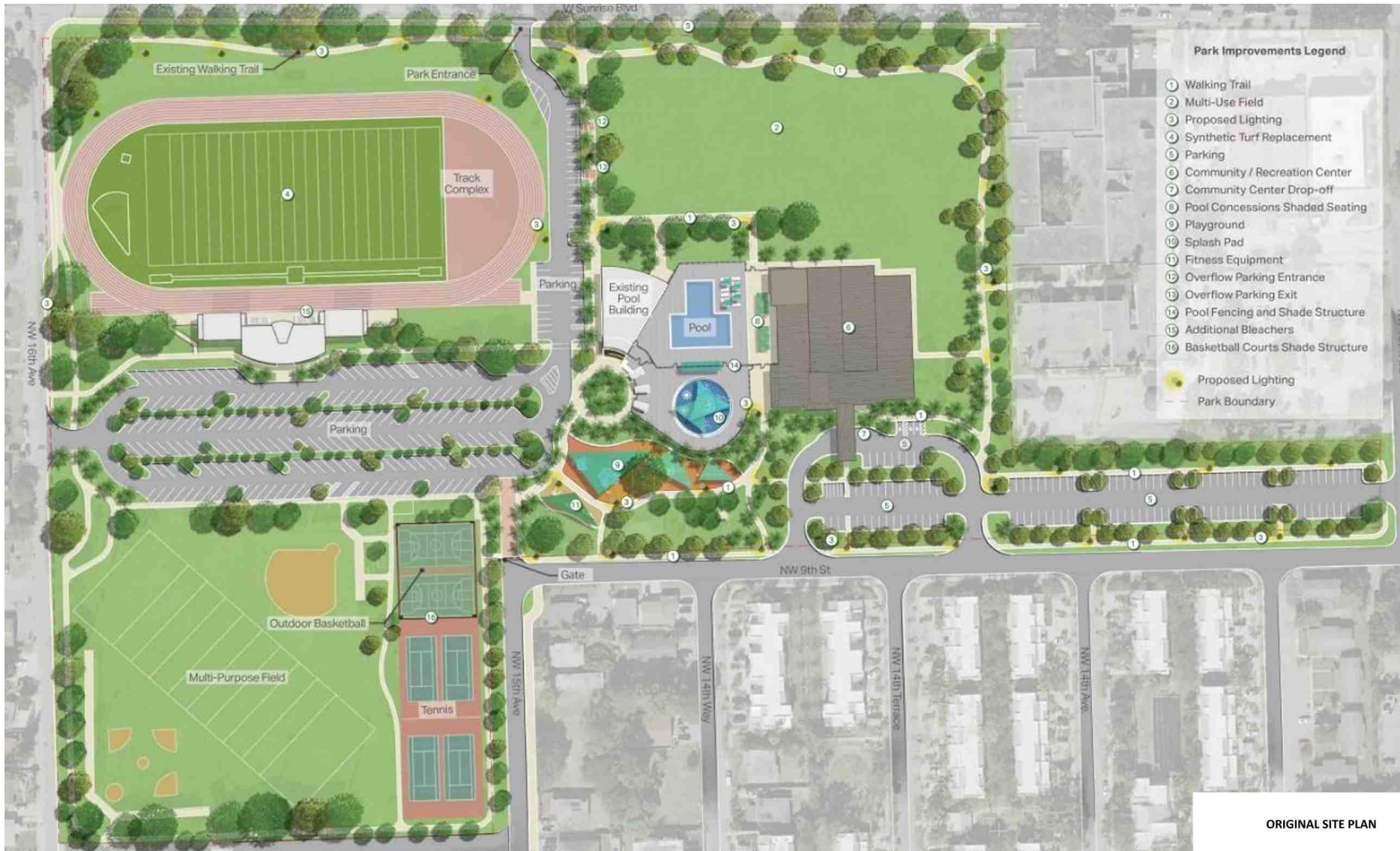
ORIGINAL SITE PLAN