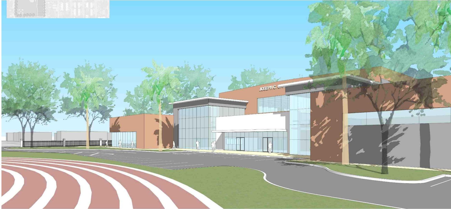
COMMUNITY CENTER MAIN ENTRANCE