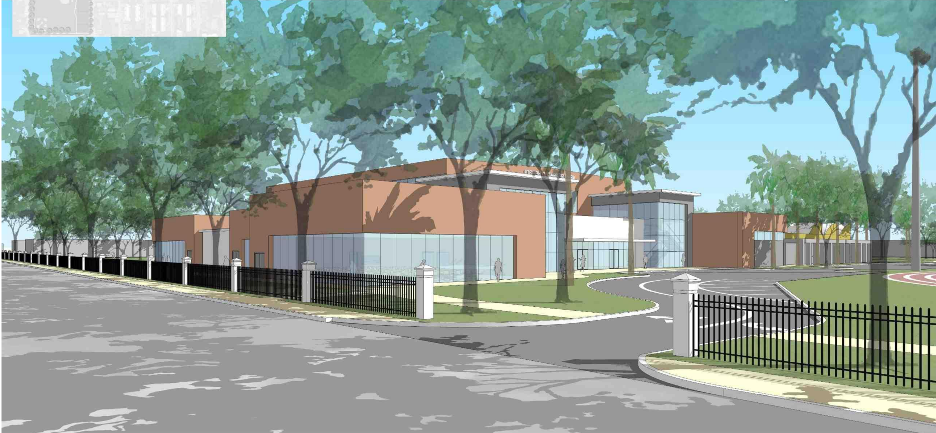
EYE LEVEL VIEW FROM SUNRISE BLVD