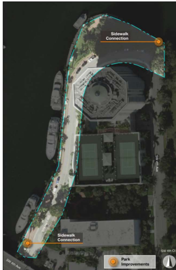
Marshall's Point Park - Proposed Improvements