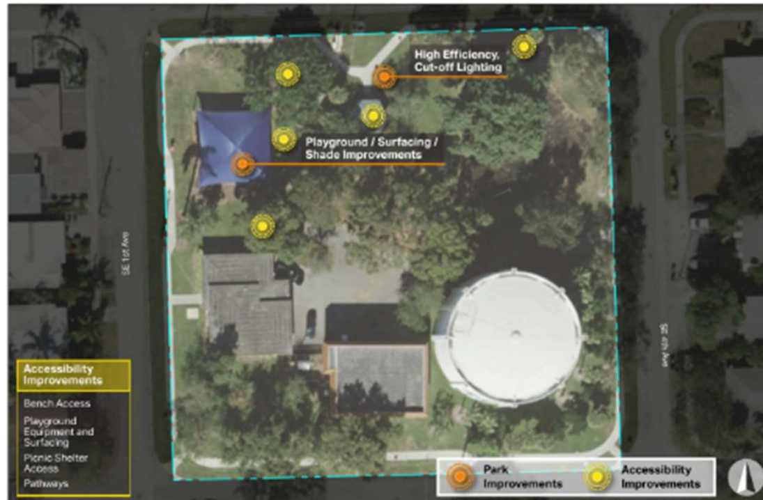
Poinciana Park - Proposed Improvements