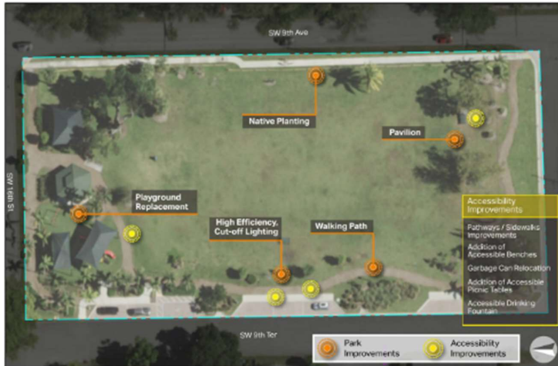
Gore Betz Park - Proposed Improvements