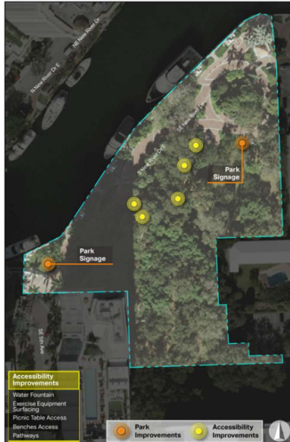
Smoker Park - Proposed Improvements