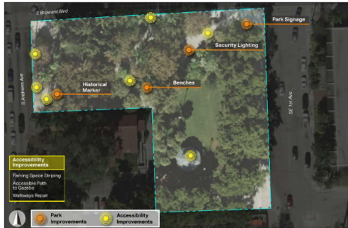
Stranahan Park - Proposed Improvements