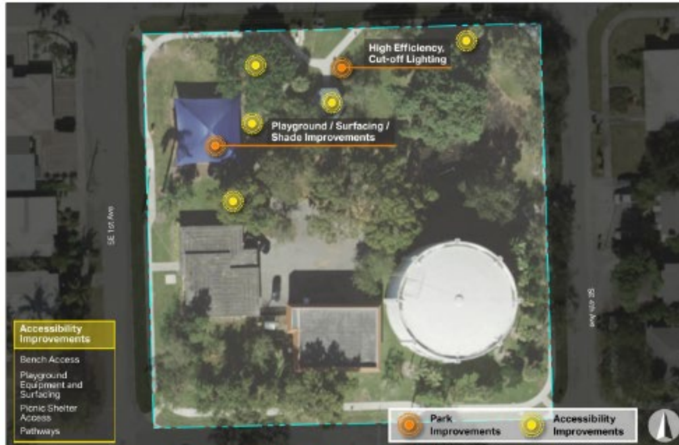
Poinciana Park - Proposed Improvements