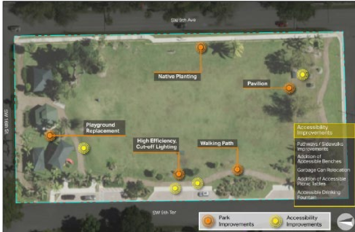
Gore Betz Park - Proposed Improvements