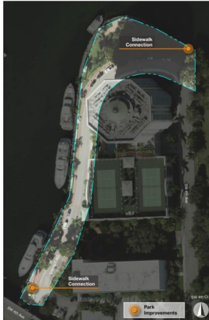
Marshall's Point Park - Proposed Improvements