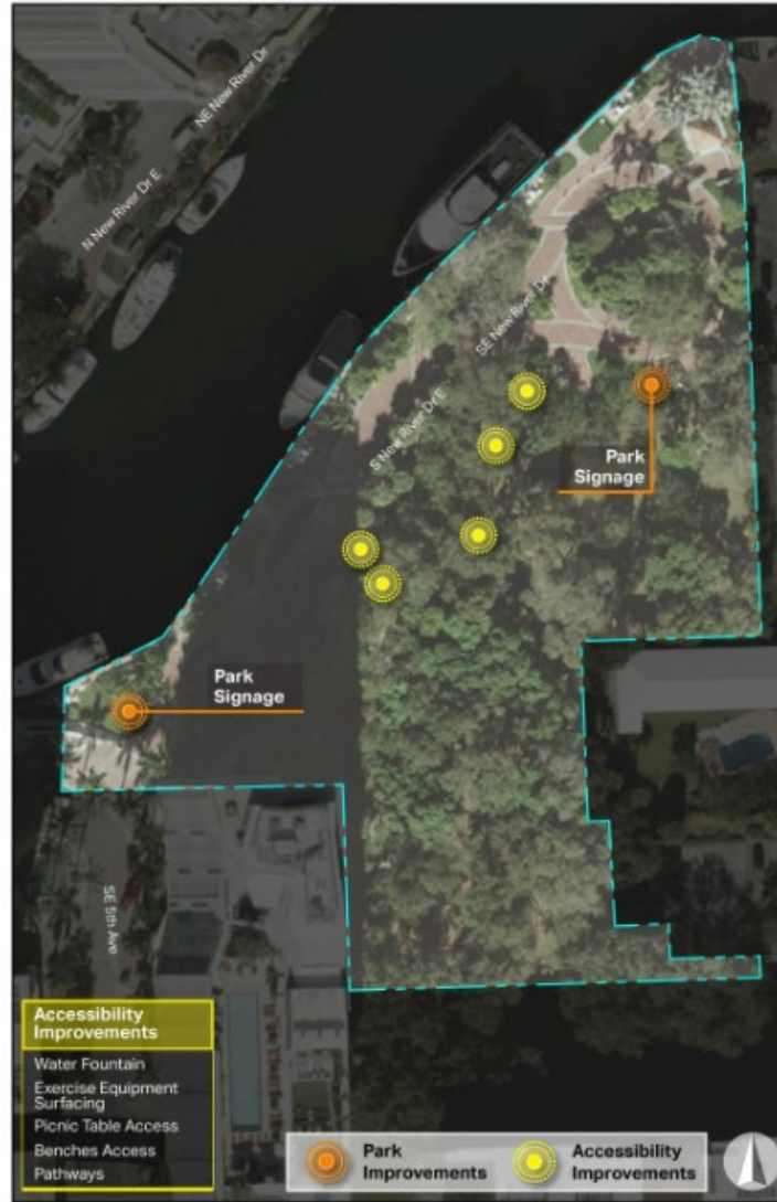
Smoker Park - Proposed Improvements