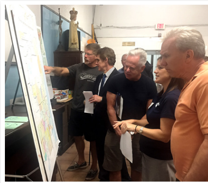
Community members actively participating in a previous public outreach meeting.