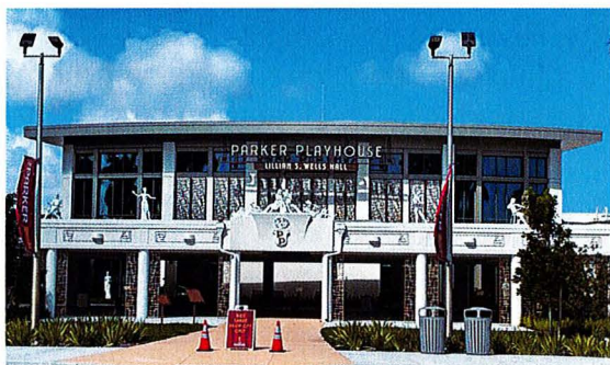
Parker Playhouse – 707 NE 8th Street

The Fort Lauderdale Fire and Safety Museum is also preparing an application to place a historical marker at the West Side Fire Station located at 1022 W. Las Olas Boulevard. This property is designated as a Historic Landmark and is in the Sailboat Bend Historic District.