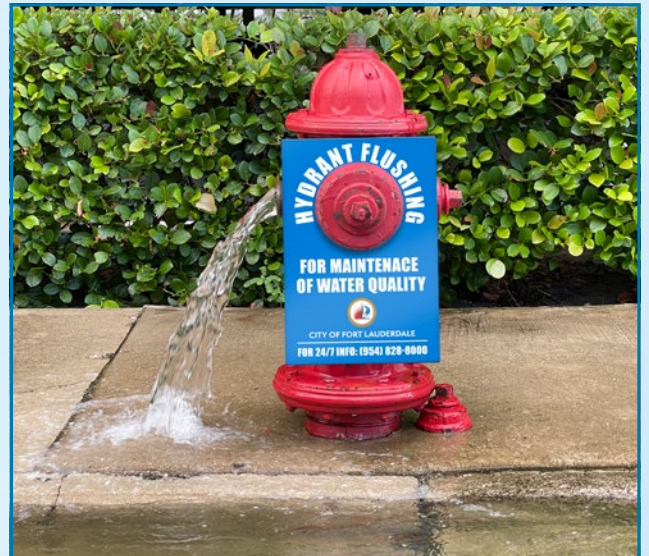
Flushing fire hydrants is a routine part of the free chlorination process.

Free chlorination is a common preventative maintenance procedure for water systems using chloramines for disinfection. The City expects the chlorination period to be transparent to our neighbors; however, some may notice a slight change in the taste or smell of their tap water. In addition, neighbors may see fire hydrants running in their neighborhoods, which is part of the normal maintenance process.