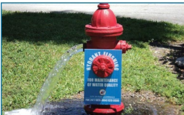
Flushing fire hydrants is a routine part of the free chlorination process.

Flushing fire hydrants is a routine part of the free chlorination process. This will occur in various parts of the City, as a result, increased flushing may be observed during this time.