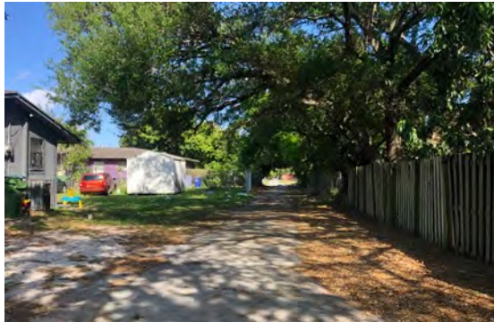
Existing condition of alley between NW 5th Street and NW 5th Court, looking east.