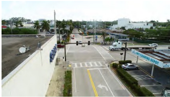
Existing conditions of intersection of NE 9th Avenue and US 1 looking east towards Holiday Park.