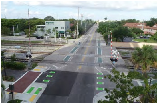
Existing condition of NW 4th Street, FEC RR crossing, and NW Flagler Avenue, looking west.