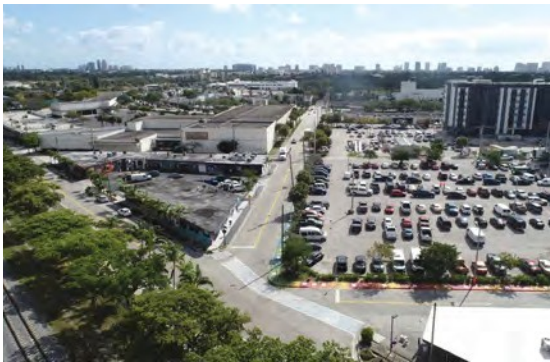
Existing conditions looking east towards NE 9th Avenue and Holiday Park.