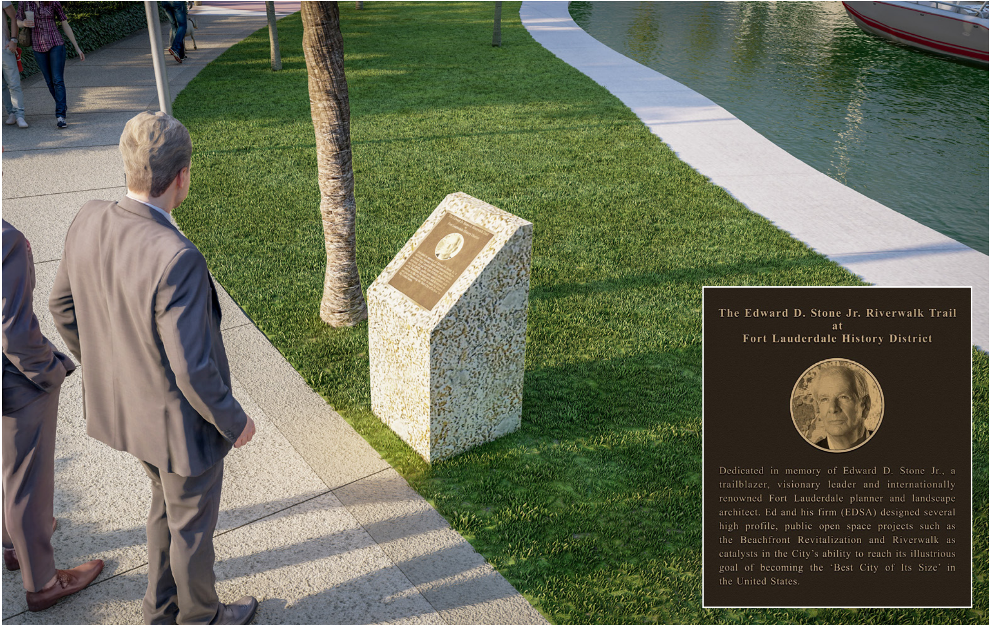
The Edward D. Stone Jr. Riverwalk Trail at Fort Lauderdale History District